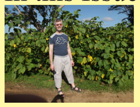
German Kava Expert Visits IAS