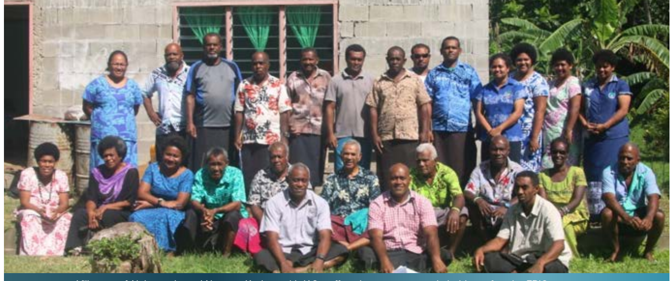
Villagers of Nabouwalu and Naqara, Kadavu with IAS staff and government stakeholders after the FPIC awareness

Institute of Applied Sciences' Pacific Natural Products Research Centre (PNPRC) carry out third Free Prior and Informed Consent (FPIC) for research and marine sample collections in the Tikina of Ono, Kadavu