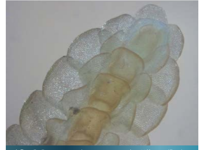
A Porella liverwort specimen as seen under 40X magnification taken at the Field Museum Bryophyte Herbarium in Chicago.

The bryophyte research work and data compilation is an important component of the services offered by the Institute of Applied Sciences in ecological and biodiversity assessments.