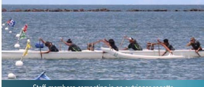
Staff members competing in an outrigger regatta

The Institute of Applied Sciences staff have involved themselves in various physical activities throughout the working week. The activities range from lunch hour gym sessions to afternoon Futsal training to name a few. This enables staff to invest in their health by taking part in an hour of physical activity that also develops stronger bonds among staff.