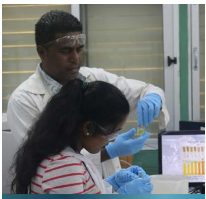
IAS training facilitator assists a participant in the Kava Colorimeter testing demonstration