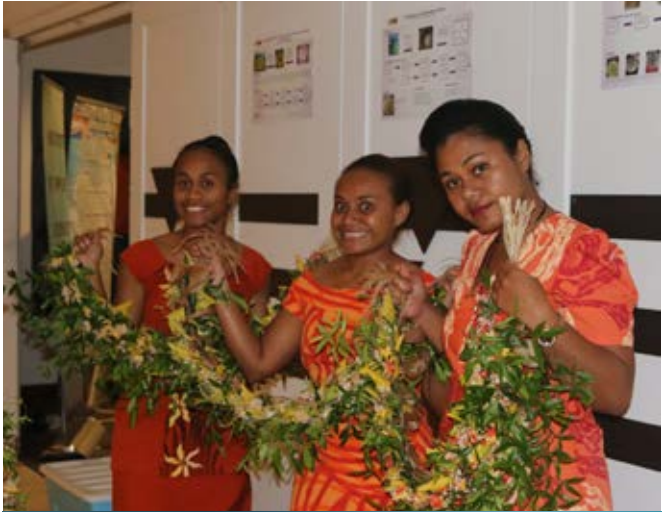
Staff prepare to garland the main guests at the Bioprospecting Samples Database launch