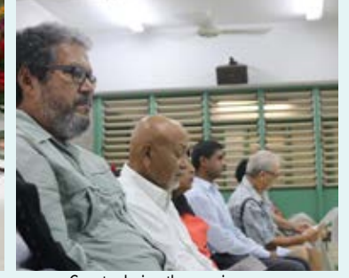
Guests during the service