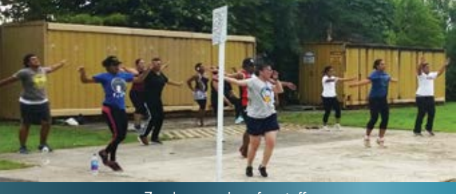
Zumba exercises for staff